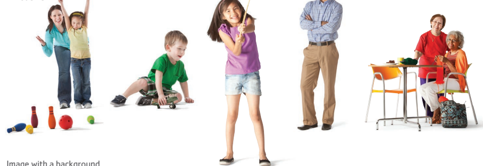
Image with a background